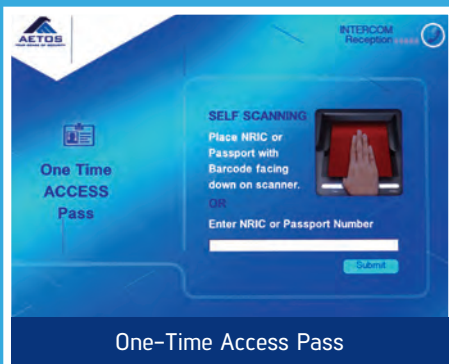
One-Time Access Pass